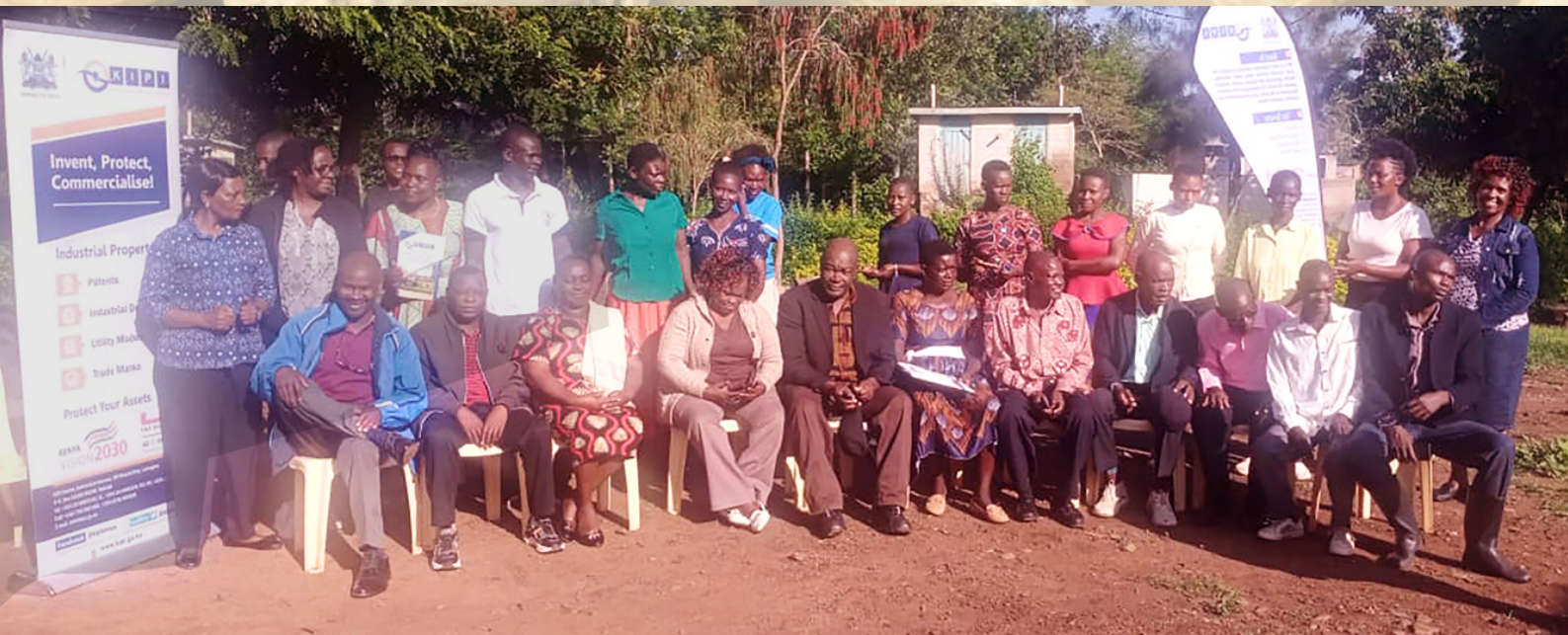
Institute's officers pose for a group photo with presenters.