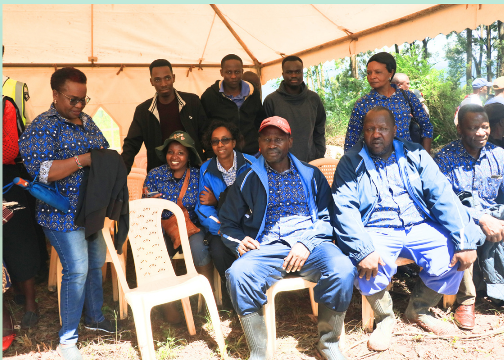
Some of the staff who took part in the tree planting ceremony