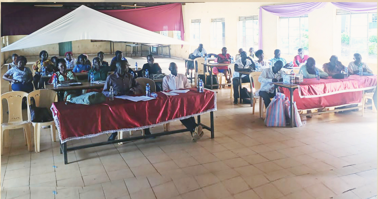
Participants listening to presentations from the Institute's officers

The Institute trained officials of the Kipingi Peanut Butter Cooperative Society in Homa Bay County on the importance of intellectual property for improved productivity and competitiveness through having a community trade mark, value addition and the development of the rules and regulations to govern the cooperative society. The training took place from 4th December to 8th December 2023.