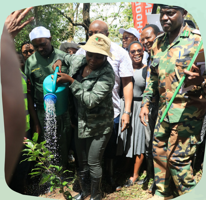
H.E. Hon. Cecily Mbarire M.G.H, Embu Governor, waters a tree after planting